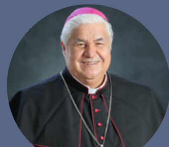
Archbishop of Monterrey, Mons. Rogelio Cabrera sent us message at the Assembly GNRC