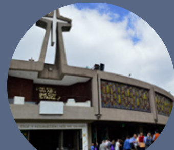
The Basilica of Our Lady of Guadalupe Walk Together

A memorable gathering of friends and colleagues from around the world. We were greeted with a letter from the Archbishop of Mexico City. We were welcomed to the Basilica of Our Lady of Guadalupe. We visited the Unesco site of Teotihuacan and had a picnic along the Xochimilco canals. We were there for Mexico Day and experienced an earthquake! Further details are found on this link https://rainbowcatholics.org/fourth-assembly-activities-summary/